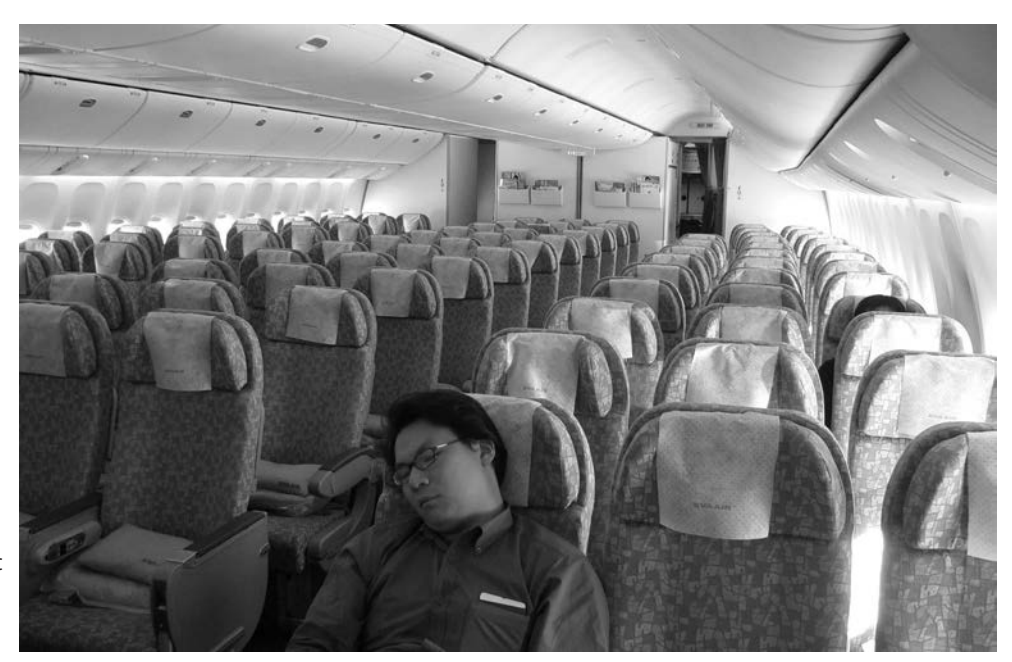
Plate 4: An economic downturn

But it would be wrong to call 2008 a global economic crisis. In Asia and the Pacific, Africa and the Middle East, the industry continued to grow but at a slower rate than in previous years. The economy of China continued to grow at over 9 per cent per year between 2008 and 2011 and at over 7 per cent between 2011 and 2014. So, against the trend in the West, China continued to be an important tourism generating country and a total of 45 million Chinese travelled overseas in 2008, up by 11.9 per cent compared to 2007 and rising to 107 million by 2014.